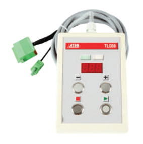
TLC 60 Remote control