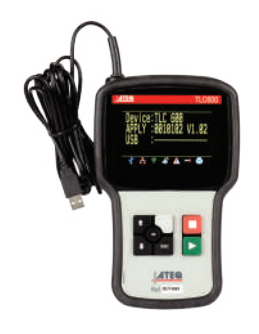
TLC 600 Remote control