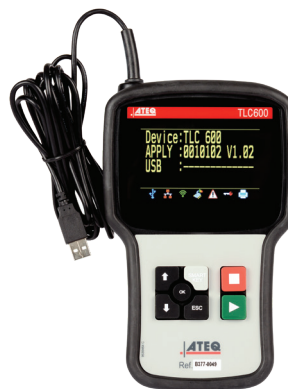
TLC 600 Remote control