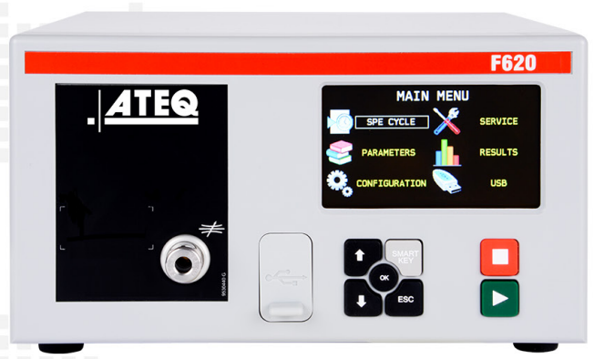
LEAK CONTROL F620